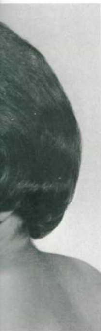
FRIO s, her. "