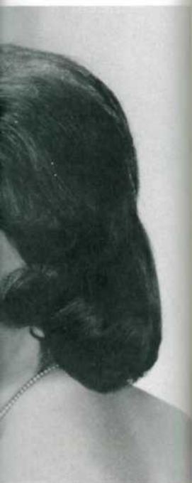
DAVIS ional flashes of si-